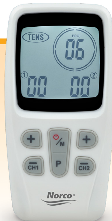
NC89481 Eco-Stim™ TENS + EMS