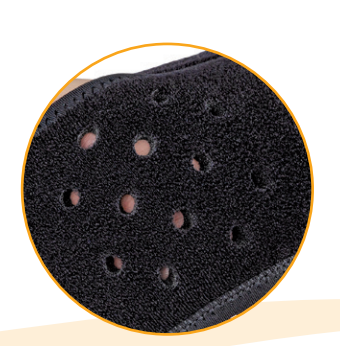
Superior ventilation design helps release heat and moisture.