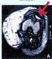
Lateral Patellar Tilt without Shields™ Brace: