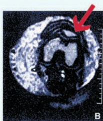
Kinematic MRI of the patellofemoral joint, active-movement against resistance technique