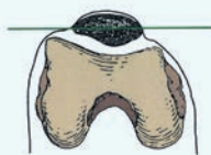
Patella in normal alignment